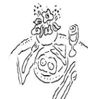
Ladies' Lunch Bunch

Our next luncheon is planned for Thursday, July 24 at 1:30 p.m. We will meet at Francesco's (formerly the Country Inn). A menu is posted on the bulletin board next to the sign-in sheet. All ladies of Peace are welcome and also may invite a guest—someone without a church or someone living alone. Please join us!