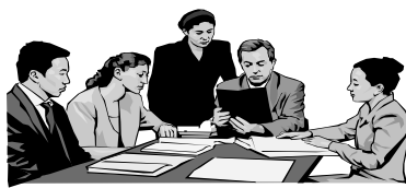
TABLE TALK BY THE FIRE

Euchre has been discontinued for the summer. Thank you to all who came and played this past winter. We will resume again in the fall. Watch for postings when we re-convene.