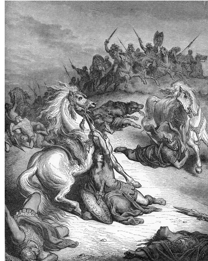
Death of Saul is from The Doré Bible Gallery (~1886)

“For the days will come upon you, when your enemies will set up a barricade around you and surround you and hem you in on every side and tear you down to the ground, you and your children.” (Luke 19:43-44a)