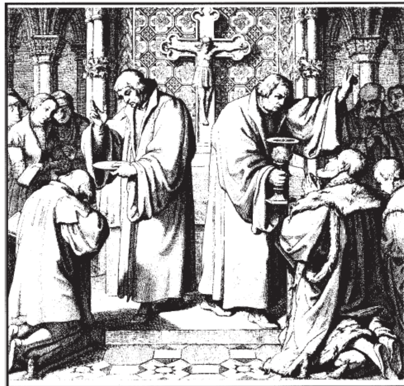
Luther and John Bugenhagen Distributing Communion in the City Church at Wittenberg by Gustav Koenig

The mission of Peace Lutheran Church is to welcome all people into the fellowship of God's love by proclaiming the forgiveness of sins through Jesus Christ and to nurture our members with God's Holy Word and Sacraments.