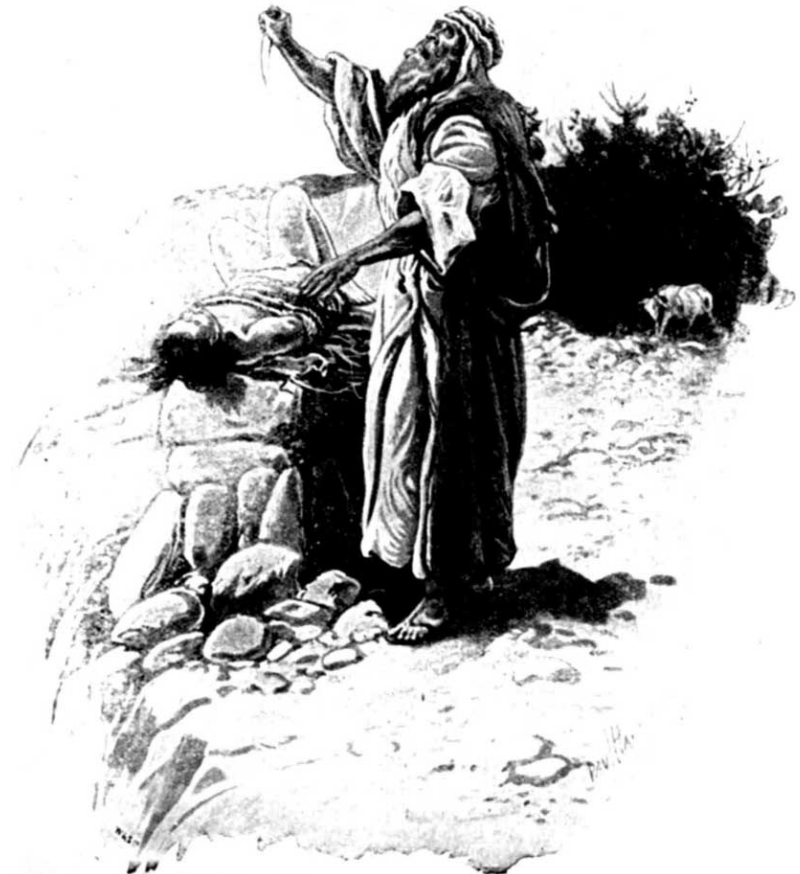
ABRAHAM OFFERING UP ISAAC --- GEN 22

The mission of Peace Lutheran Church is to welcome all people into the fellowship of God's love by proclaiming the forgiveness of sins through Jesus Christ and to nurture our members with God's Holy Word and Sacraments.