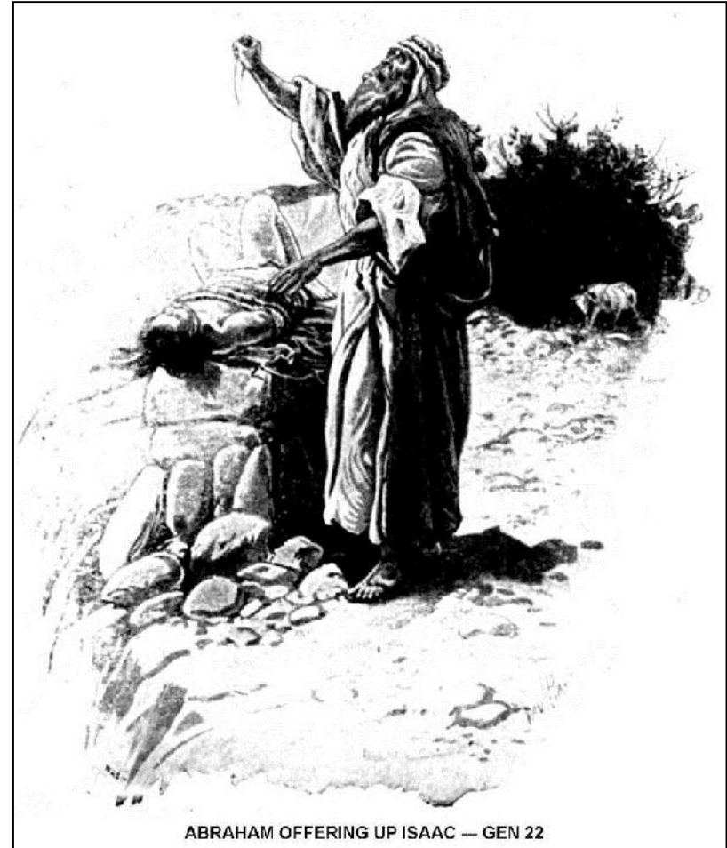
ABRAHAM OFFERING UP ISAAC — GEN 22

The mission of Peace Lutheran Church is to welcome all people into the fellowship of God's love by proclaiming the forgiveness of sins through Jesus Christ and to nurture our members with God's Holy Word and Sacraments.