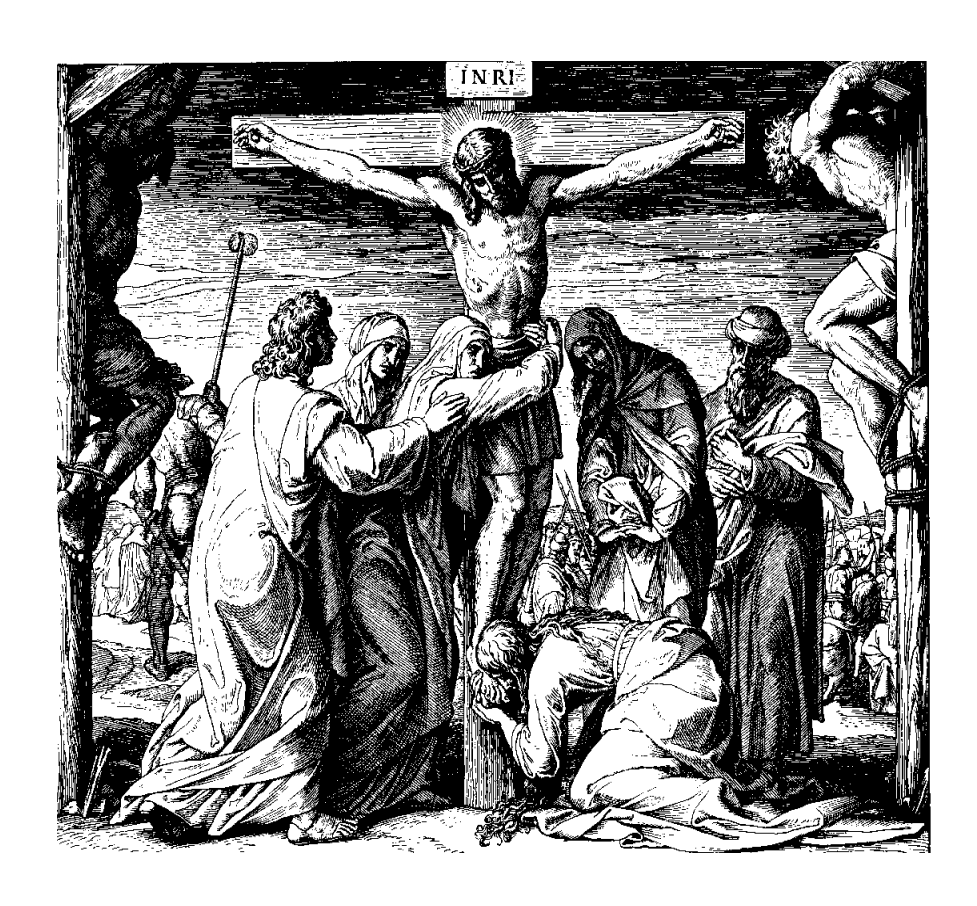
"He Was Pierced for Our Transgressions!"