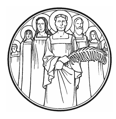
"Oh, blest communion, fellowship divine! We feebly struggle, they in glory shine; Yet all are one in Thee, for all are Thine. Alleluia! Alleluia!" (LSB 677:4)