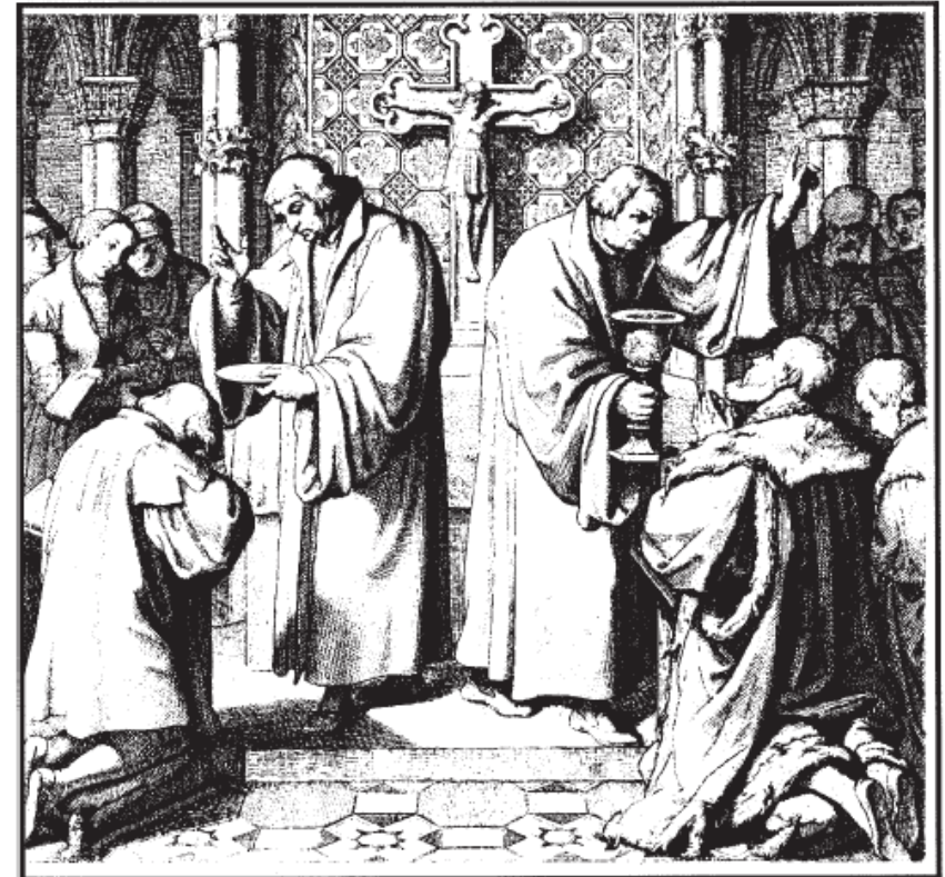
Luther and John Bugenhagen Distributing Communion in the City Church at Wittenberg by Gustav Koenig

The mission of Peace Lutheran Church is to welcome all people into the fellowship of God's love by proclaiming the forgiveness of sins through Jesus Christ and to nurture our members with God's Holy Word and Sacraments.