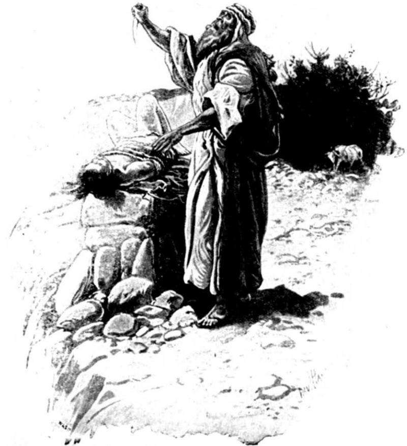
ABRAHAM OFFERING UP ISAAC --- GEN 22

The mission of Peace Lutheran Church is to welcome all people into the fellowship of God's love by proclaiming the forgiveness of sins through Jesus Christ and to nurture our members with God's Holy Word and Sacraments.