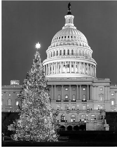
National Christmas Tree—Wash. D.C.