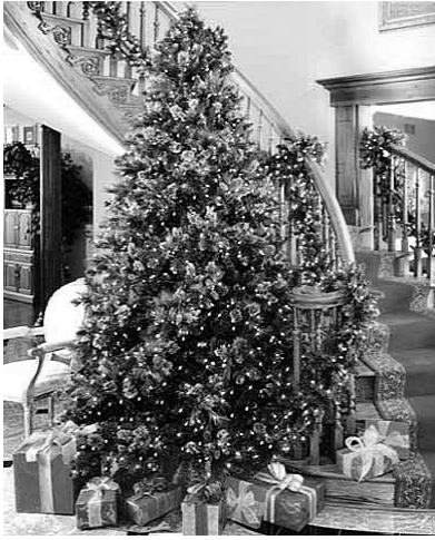
A Christmas tree in the home