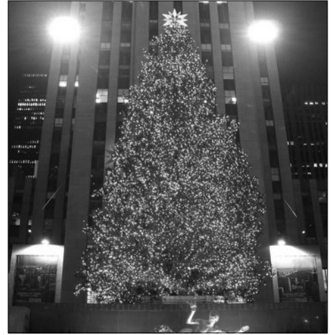
Rockefeller Center Christmas Tree—New York