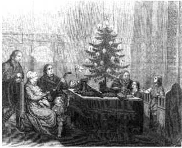
Riga's first Christmas tree in 1510 A.D.

(The story of the supposed first Christmas tree in Riga, Latvia)